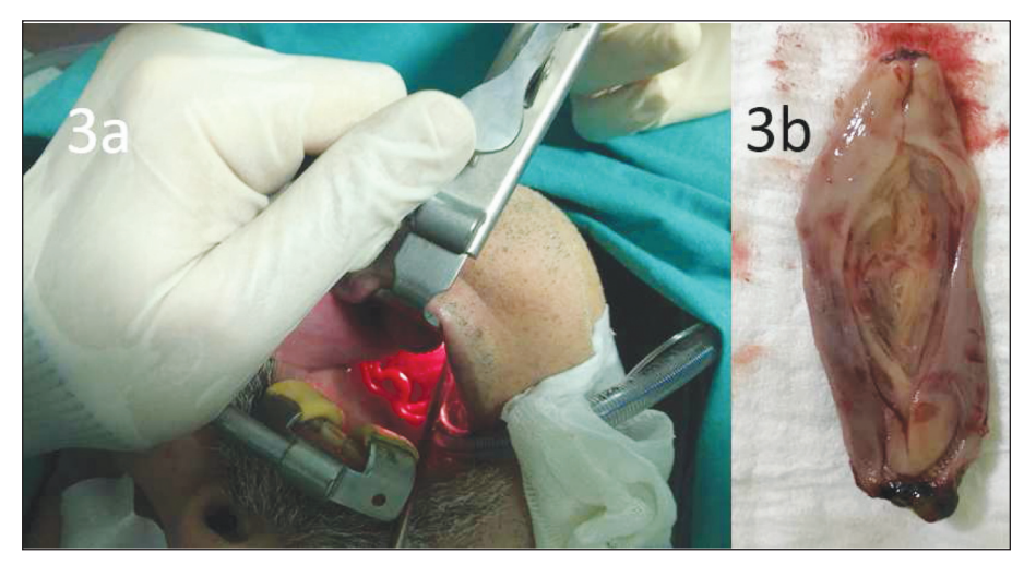
FIGURE 3: a) A Davis-Boyle mouth gag was inserted into the mouth. b) Giant fibrovascular polyp (9x3.2x2.8 cm).

They are usually asymptomatic. Globus sensation, dysphagia, stridor, weight loss can be seen. After gagging, the polyp can cause sudden respiratory arrest due to laryngeal obstruction.<sup>6</sup> In our case, the patient presented to our clinic with a mass protruding from his mouth.