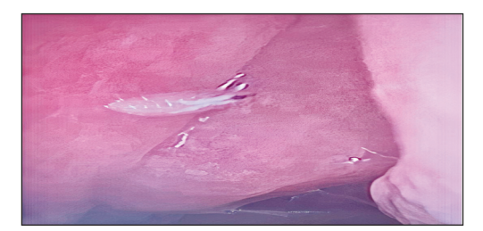
FIGURE 3: Endoscopic view of nasal myiasis of case-8.