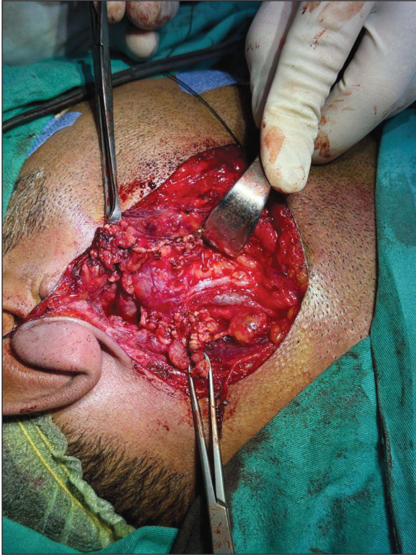
FIGURE 3: The appearance of a schwannoma of facial nerve origin

vagal schwannoma had postoperative vocal cord paralysis and was treated with type 1 thyroplasty. The patient with a mass originating from the brachial plexus had mild postoperative weakness (4/5), which improved after physical therapy.