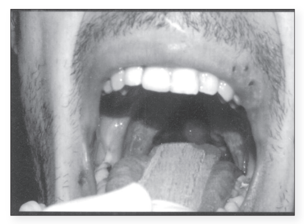
Figure 1a . Oral examination revealed bilateral enlargement of the palatine tonsils , with a few write to yellowish plaques on the surface

After the histopathological diagnosis, medical treatmentwas started to patient. Isoniazid 300 mg, rifampin 600 mg, ethambutol 1500 mg, morphazi-