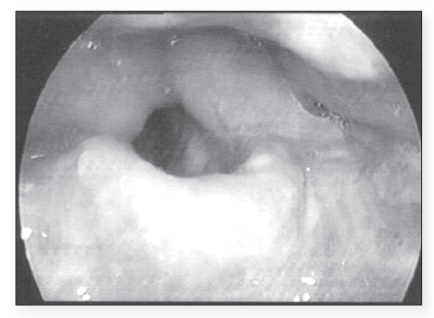
Figure 1b . Videolaryngoscopic examination showed the presence of edema and enlargement of the bilateral aryepiglottic folds, arytenoid cartilages and pyriform fossas.