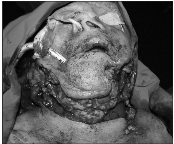
Figure 4. Surgical debridement of necrotic soft tissue.

It is difficult to diagnose NF in early stages due to its benign appearance. In the early stage, the skin is in-