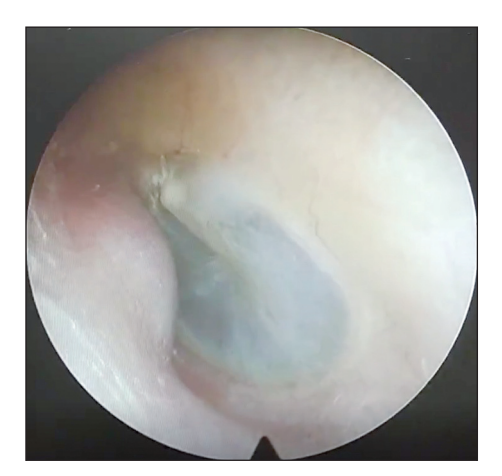
FIGURE 1: The left external auditory canal when the mouth closes.

There is a bony wall between EAC and TMJ. Foramen Huschke (FH) or foramen tympanicum can be found in different rates in this wall. Herniation of TMJ does not develop in every patient with FH. Er-