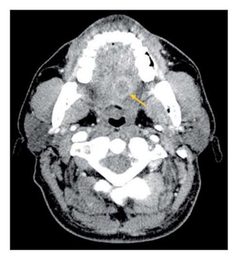
FIGURE 1: Neck CT examination of case 1, axial section.

A 28-year-old female patient hospitalized in the Hematology Department and receiving chemother-