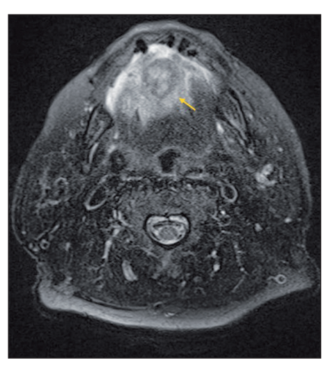
FIGURE 2: Facial MRI examination of the case 2, axial section.

apy for acute lymphoblastic leukemia (ALL) was consulted to our clinic. The patient reported pain, swelling of the tongue, and dysphagia. Physical examination revealed the presence of multilobed abscess that was fistulized. The patient had poor oral hygiene and multiple caries. The patient had no history of other systemic diseases and smoking. Some routine laboratory test results were as follow: WBC, 5.6 10<sup>3</sup>/μL (NE, 83.1%; LY, 11.4%, MO, 4.5%), and CRP, 207 mg/L. CT was performed, and a mass confirming the presence of an abscess was detected (Figure 3). The multilobed abscess was drained under regional anesthesia. Necrotic tissues were debrided every day. Dental hygiene problems were fixed. The culture of the pus was reported as the presence of