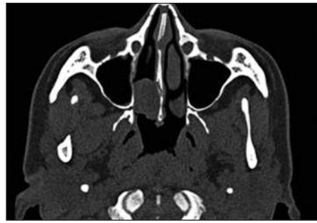
Figure 1. Axial CT of paranasal sinus shows the soft tissue mass originating from the right middle turbinate.

A 34-year-old woman was referred to the department of otorhinolaryngology with a four-month history of nasal obstruction and intermittent nasal bleeding on the right side. Nasal endoscopy revealed a fragile, partly sloping, reddish-pink mass arising from the right middle turbinate. Her otolaryngologic examination was otherwise normal. She had no history of trauma or nasal packing. Axial computed tomography (CT) of the paranasal sinus showed a soft tissue mass arising from the right middle turbinate (Figure 1). There was no evidence of bony erosion. The size of the mass was approximately 12*10*8 mm. A punch biopsy of the nasal mass was done under local anaesthesia. The pathology result was pyogenic granuloma. Preoperative laboratory testing was normal and surgery was done under general anaesthesia. Using a 30° nasal telescope, the mass was excised, together with the inferior 1/3 rd of the middle turbinate, via nasal forceps and suction cautery (Figure 2). Minimal bleeding was controlled via bipolar electrocautery. The postoperative period was uneventful and the patient had no complaints. Histopathological examination of the nasal mass revealed it to be a pyogenic granuloma. At the 1-year postoperative follow-up, there was no evidence of recurrence or residual disease.